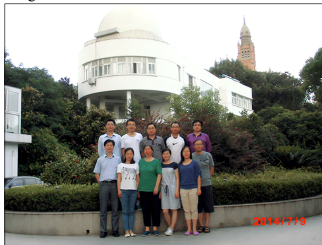
Photo of members of Shanghai SLR station