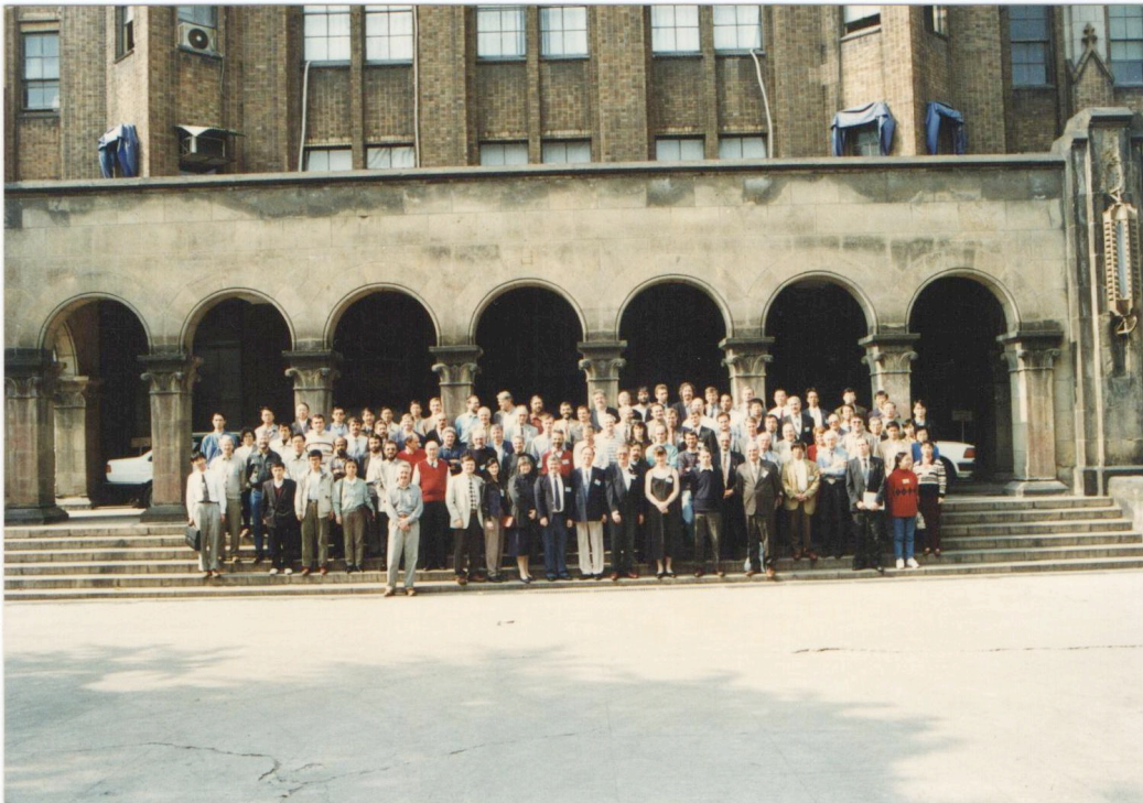
Photo of 10 th International Workshop on Laser Ranging in Shanghai