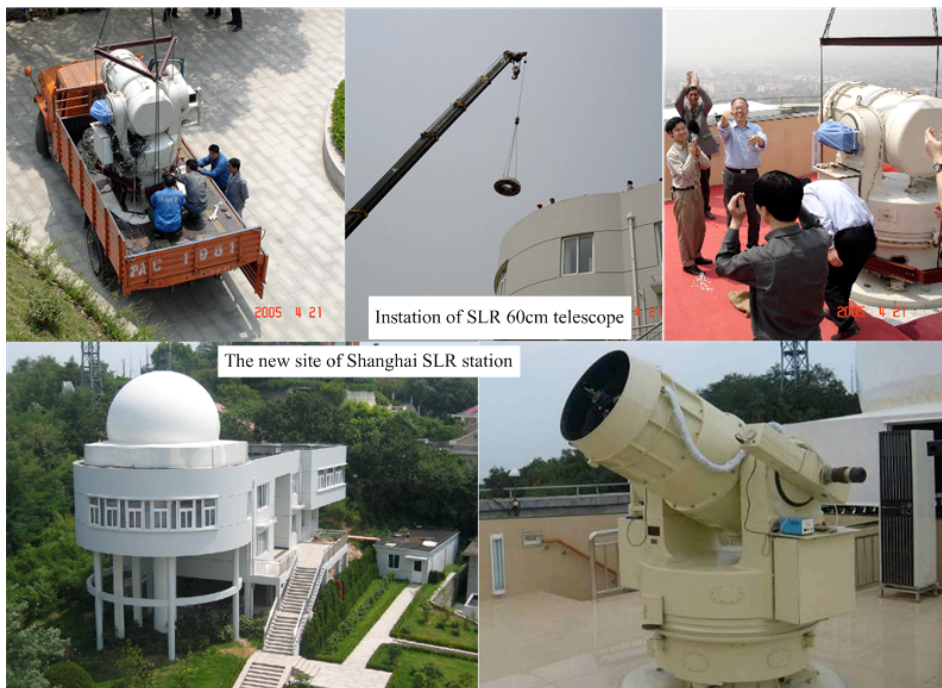
The new site of Shanghai SLR station