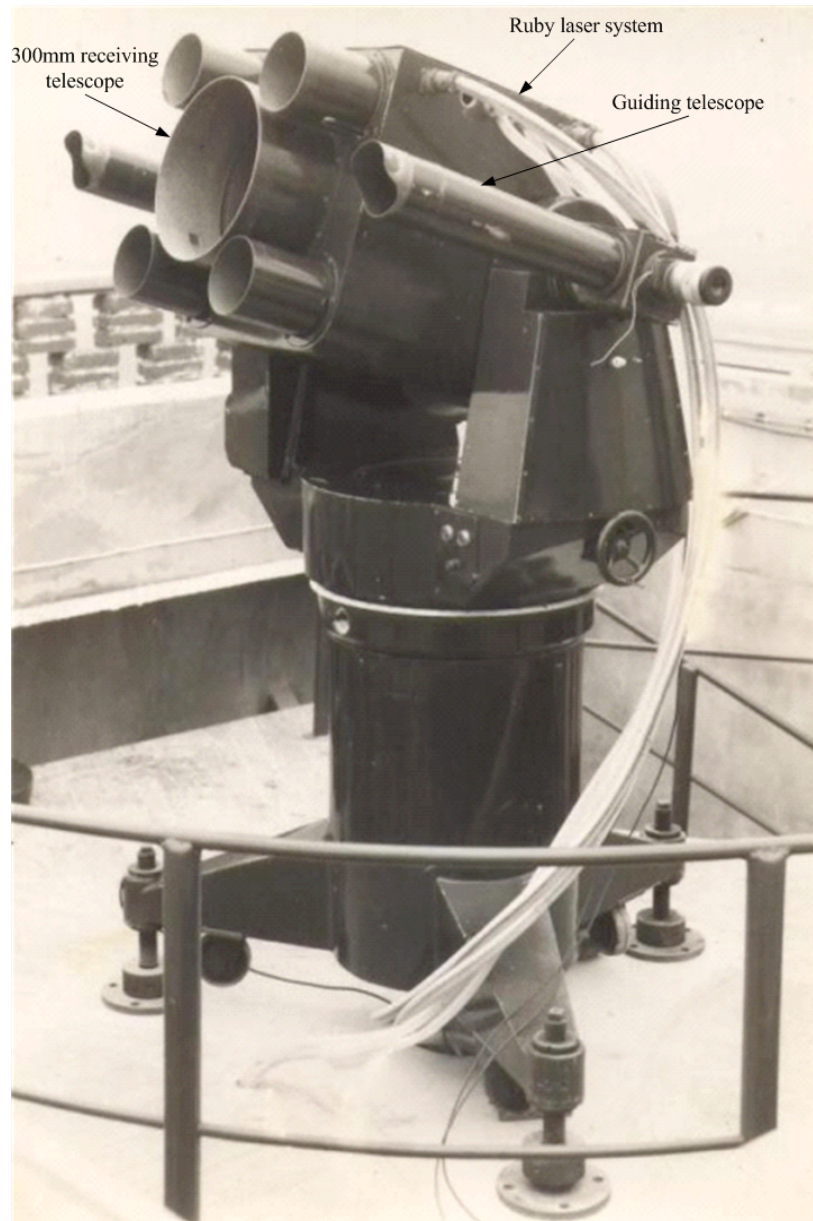
The first generation of SLR system in Shanghai SLR station